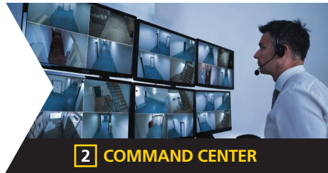
2 COMMAND CENTER

Home healthcare worker activates alert with the STANLEY Guard Personal Safety app by shaking their phone or pressing a wearable button.