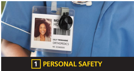
1 PERSONAL SAFETY

Home healthcare worker activates alert with the STANLEY Guard Personal Safety app by shaking their phone or pressing a wearable button.