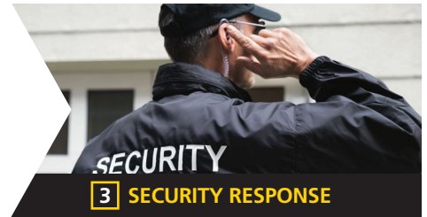
3 SECURITY RESPONSE

Experienced STANLEY monitoring specialists or your security operations center receives the alert, along with the device's GPS location, audio/video clips, and user's profile info and verifies the emergency.