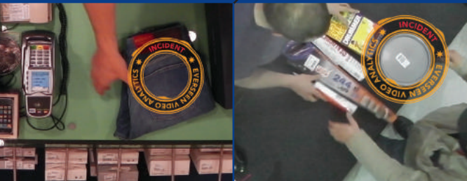
DIY: EXPRESS NON-SCAN