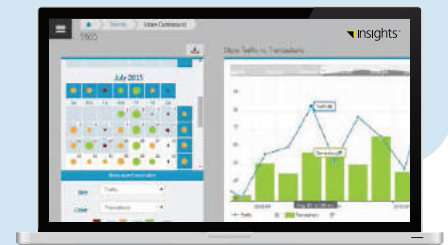
Dashboard Visualization & Analytics