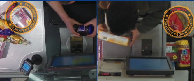
FASHION: EXPRESS NON-SCAN